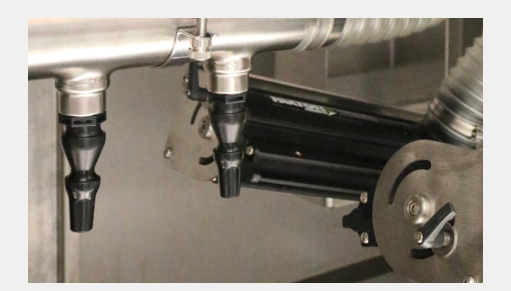
Optional Air Nozzles and Manifolds Fully adjustable nozzles that deliver highvelocity air streams, as well as spot-drying to targeted areas.

An integrated mounting and adjustment system enables easy configuration for different sized/ shaped packaging.