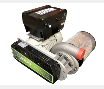
Centrifugal Blower Range Our range of centrifugal blowers has unrivalled reliability and is suitable for a wide variety of applications and industries.

For more information on the MultiPack Drying Systems or SolvAir's Engineered Air Solutions please contact us.