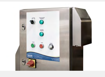
Optional System Controls Total system control, from basic stop/start operation, to fully reactive and automatic controls.